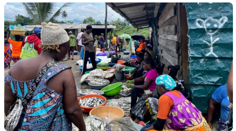
Women fish traders in Cameroon.

Insufficient investment in and use of gender-specific data is an obstacle to effective policy development in Sub-Saharan Africa. We bridge this gap by gathering information that intersects gender, climate change and illegal, unreported and unregulated fishing.