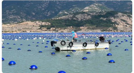
Recreational angler in mariculture area in China.

Because the ecosystem services offered by mariculture--especially Integrated Multi-Trophic Aquaculture systems--have been largely overlooked, delving deeper into this field could help producers, policymakers, and the general public appreciate the advantages of multi-species integrated mariculture systems.