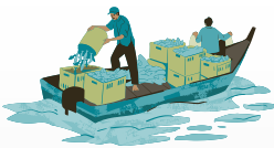
Reducing eutrophication and hypoxia to support fisheries