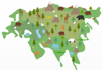
Improving spatial planning for food systems