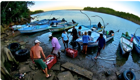
Small-scale fisheries, Pacific Coast of Costa Rica.

Our project empowers small-scale fishers to co-create sustainable ocean solutions, integrating local knowledge with science to shape inclusive, ecologically sound, and socially just ocean governance through participatory research.