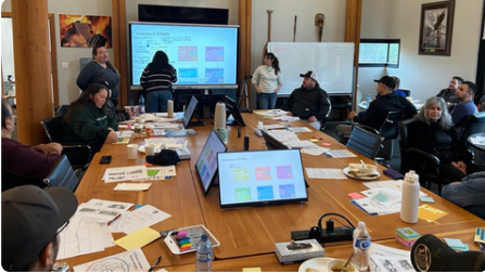
Solving FCB workshop with Tla'amin harvesters.

This research involves Tla'amin Knowledge Holders and harvesters to better account for the community's needs and challenges. While Tla'amin Knowledge Holders define the new path for the Modern Treaty negotiations, Tla'amin harvesters share their experience into the development of the Marine Plan.